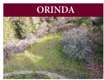
154 Glorietta Blvd. Build dream home on .98 acre lot with views near top rated Glorietta School. Ideal close in commute location.